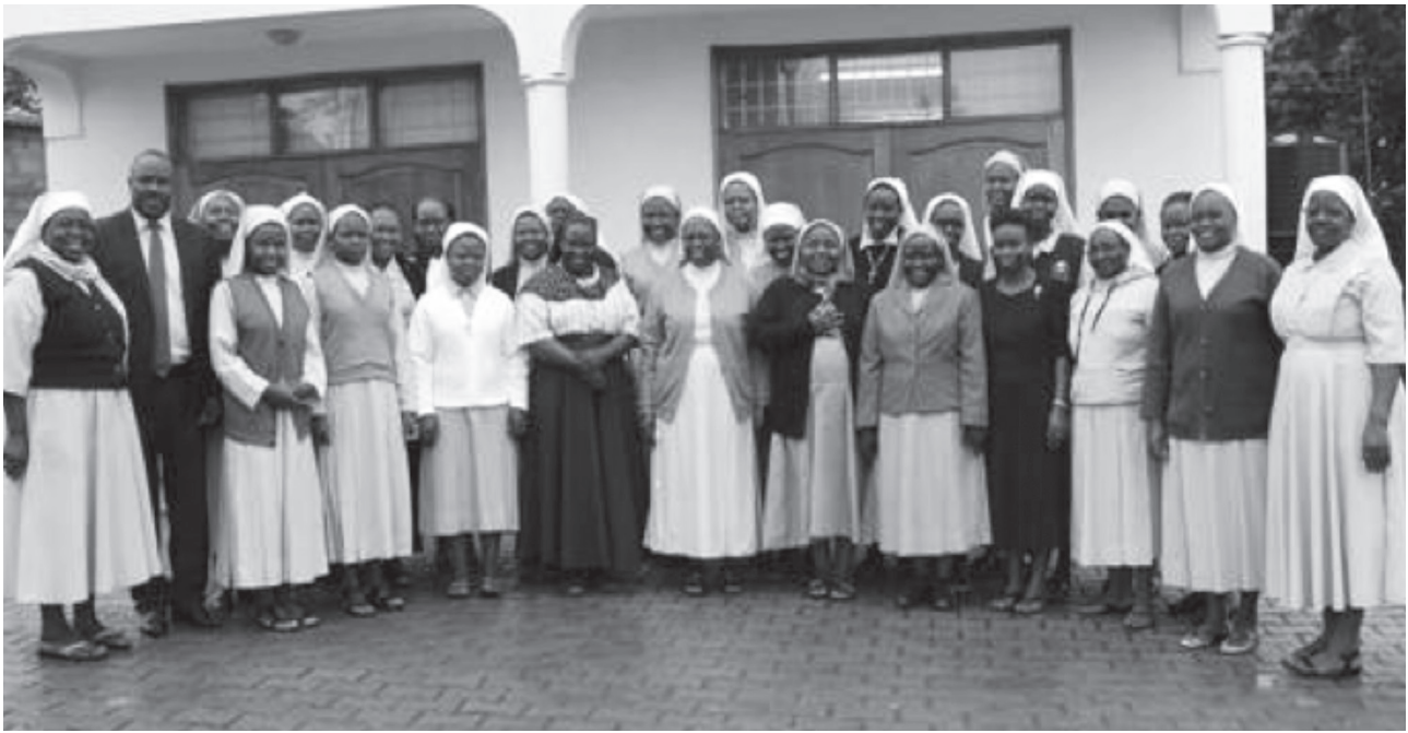
FIGURE 3. THE SECRETARY GENERAL OF THE ASSOCIATION OF RELIGIOUS IN UGANDA WITH PARTICIPANTS OF AN ASEC ADMINISTRATION WORKSHOP