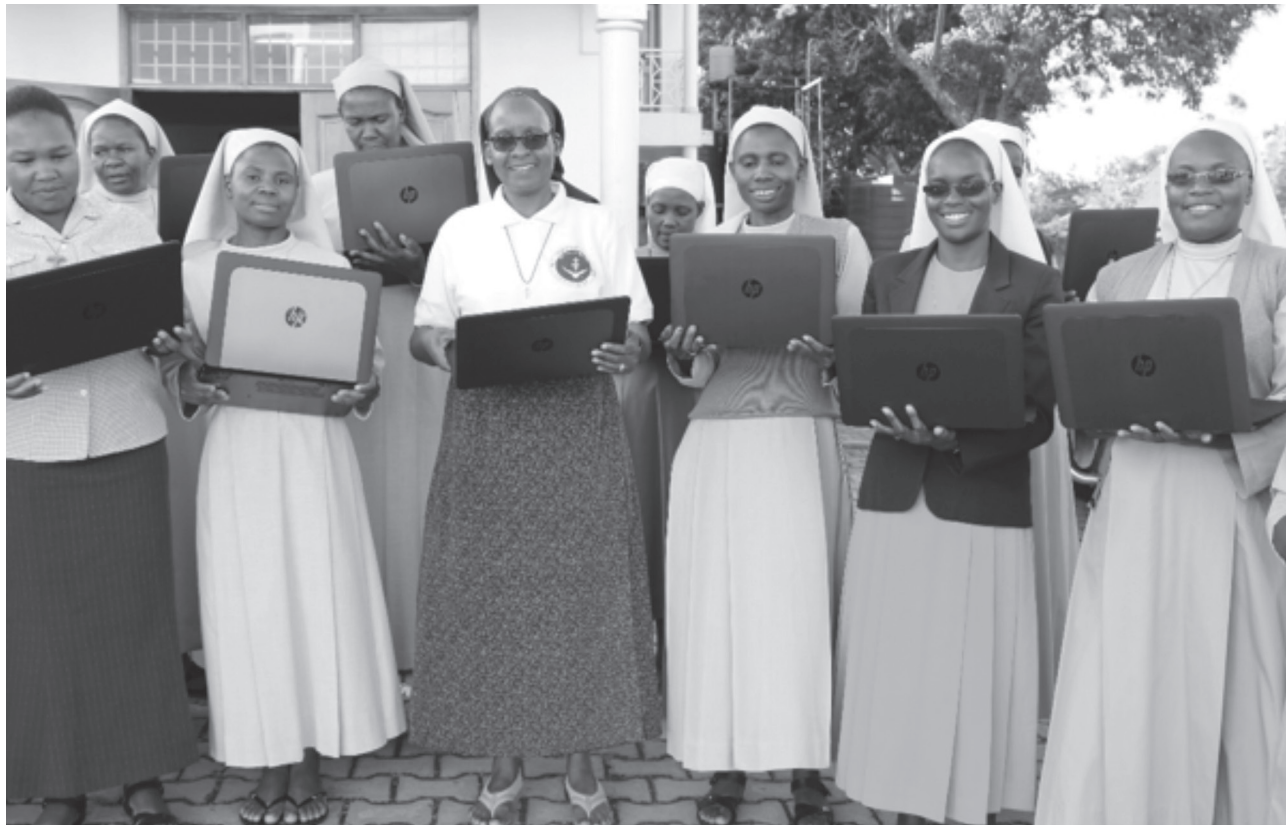
FIGURE 4. SLDI PARTICIPANTS HAPPILY HOLDING THEIR NEW LAPTOPS

Through its research program, ASEC investigates different elements of the experiences of African religious communities. Some of the findings were published in a book "Voices of Courage". ASEC's efforts to educate and to equip African sisters with innovative skills and knowledge have been augmented in their latest "scholar exchange" program. This exchange allows sisters from Africa to visit the Center for Applied Research in the Apostolate (CARA) for six months at a time, to acquire training in applied social science research that they can use at their home country upon their return.