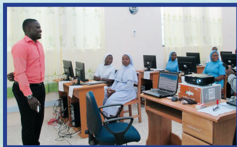
New Computer Lab in Ghana.