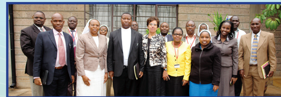
Partnerships are at the core of HESA. Representatives of CUEA meet with ASEC and Conrad N. Hilton Foundation.