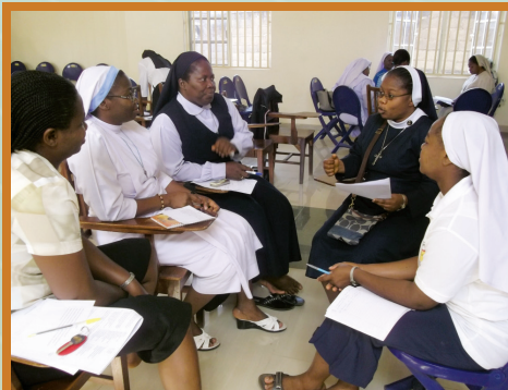
Sisters in deep discussion at an Alumnae Meeting, July in Nigeria.

In 2013 the Conrad N. Hilton Foundation awarded $4.5 million to support the SLDI program in nine countries in Africa. SLDI Phase III successfully commenced in eight countries. SLDI has expanded to benefit Malawi and South Sudan, while also continuing the program in Ghana, Nigeria, Kenya, Uganda, Tanzania and Zambia. Altogether, 240 sisters are participating in Web Design and Basic Technology Workshops