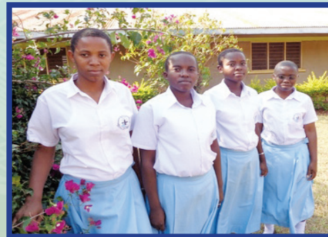
Making a Difference - four girls are attending the Bigwa Secondary School because of the generosity of faculty at Marywood University. Thank you!