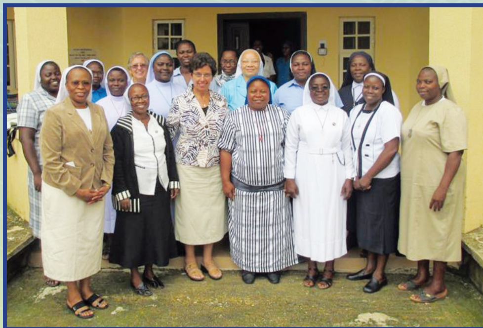
Nigeria Conference of Women Religious (NCWR) after the meeting at Jos, Nigeria outside the formation center of the Society of the Holy Child Jesus.