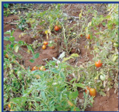
Beautiful tomatoes as a result of the borehold project at the Bigwa School.