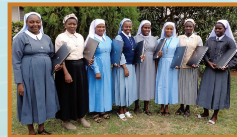
Sisters attending SAUT stand proudly with their laptops.

The Sisters Leadership Development Initiative (SLDI) is an innovative program with the overarching goal to increase access for management and leadership skill-building for African Sisters through training and education that are adaptable to the specific needs and contexts in which the Sisters are working. Since inception in 2007, SLDI has benefited over 800 sisters and over 1,600 of their colleagues and co-workers have been mentored. Using their newly acquired skills, SLDI alumnae have raised over $4.6 million through grant writing and fundraising initiatives. Sisters use their newly acquired knowledge and skills to effectively serve their people in schools, healthcare facilities, social service ministries, rehabilitation centers, supporting people with disabilities, training people on arable farming, and other development and pastoral oriented projects. Impacts created by sisters in their ministries are a testimony that Catholic sisters, the workforce of the Catholic Church in Africa, are working