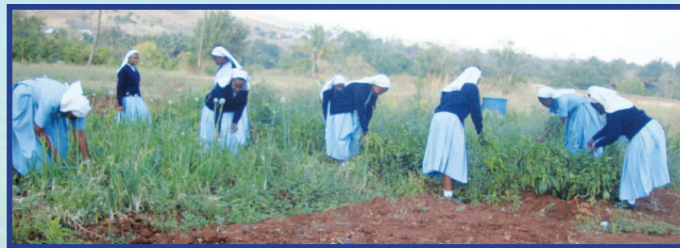
Sisters at the Bigwa School pick vegetables at their farm. This would not have been possible without the support of the GHR Foundation for the borehole project!