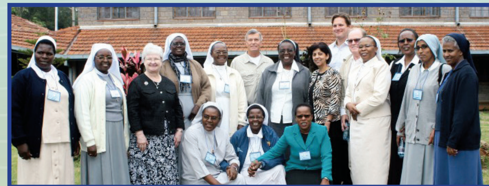
ACWEA Representatives together with the Conrad N. Hilton Foundation with ASEC in Nairobi, Kenya