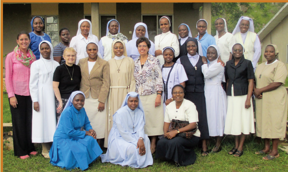
SLDI students pose with ASEC partners after a Technology and Web Design training in Nigeria, July 2013.

Sisters who finish the SLDI program have been strengthened by their experience. They have learned so much, have created new bonds with their sisters, and relish the shared creativity