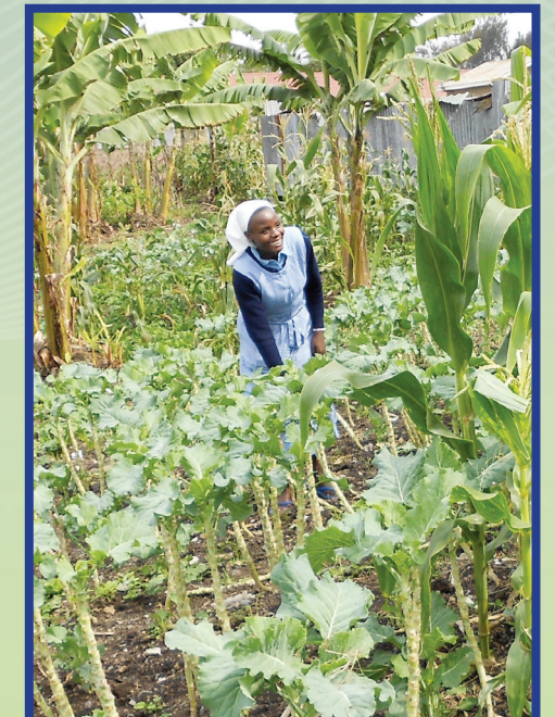
Farming is one of the key areas that sisters engage in to support their ministries.