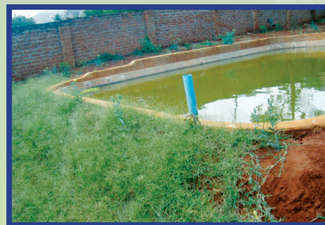
A fishpond provides protein supplements to the students of Bigwa.