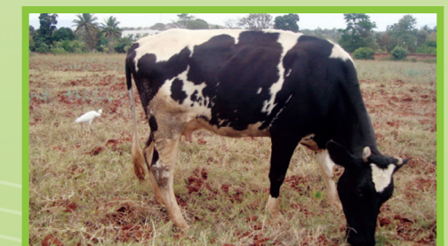
From one cow there are now three and students at Bigwa have plenty of milk.

Students from ASEC consortia colleges travel to the Bigwa School in Morogoro, Tanzania to provide English tutoring and to have a cross-cultural experience in Tanzania. Over 58 students and 14 faculty chaperones from Chestnut Hill College, Marywood University and Rosemont College share experiences that impact their lives. Students have been affected by how students at Bigwa can study with very little resources yet they are competing on a global landscape with the haves. One of the American students was so touched that she donated $1,000 of her graduation money to buy a cow for the Bigwa School so that students there can have milk to supplement their diet.