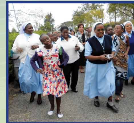
Evangelizing Sisters of Mary in Nairobi who support an HIV/AIDS program that supports vulnerable children and provides voluntary counseling.