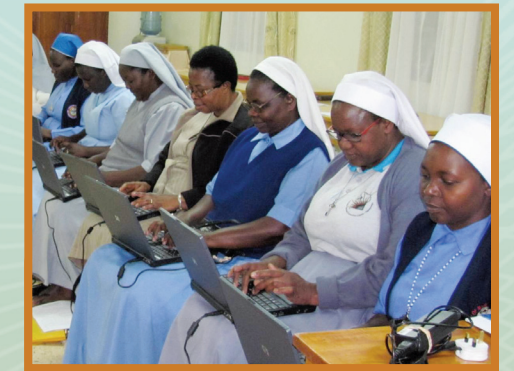
Sisters are becoming technological geeks.