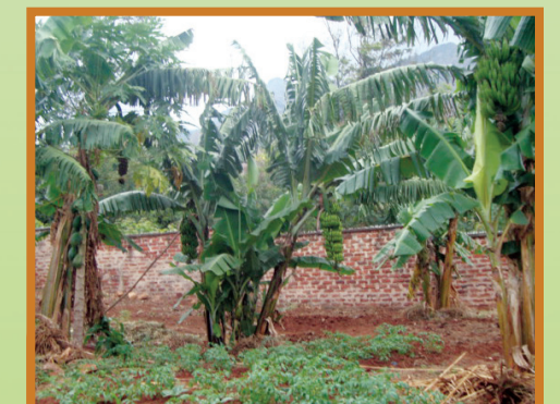
A borehole has enabled sisters to grow food crops that provide a supplementary diet for students at the Bigwa School.

A borehole at the Bigwa School has provided the so much needed water for the school and locals. Thanks to the GHR Foundation for their support! Because of the borehole, Bigwa is now able to supply clean running water not only to the students attending the school, but to supply irrigation to the garden, and water for cattle and a fish pond.